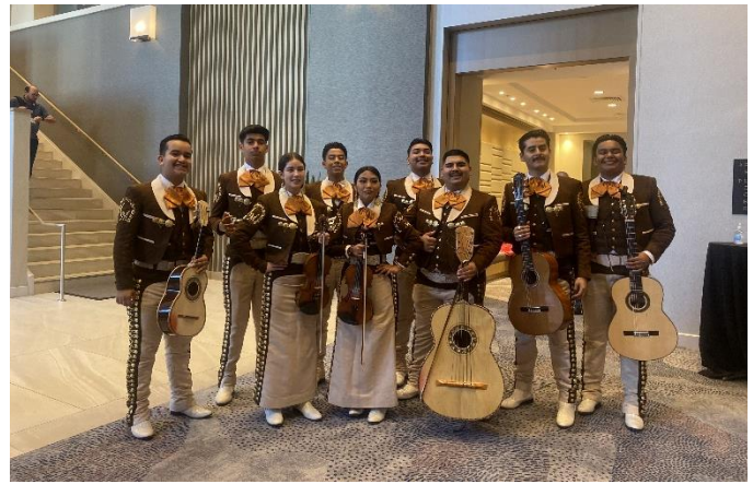
(Mariachi Juvenil Herencia Michoacana)

Eleven keynote panels provided training and discussion on the following topics: Treating Dissociation in Adult Survivors of Abuse and Trauma ; B.B. Rossman Memorial Panel: Current Challenges in Child Sexual Abuse Prevention ; Family Courts and Reunification Programs ; Violence, Trauma, and Migration ; Achieving Violence Free and Substance Abuse Sobriety in Abusive Men ; Integrating Research, Practice, Policy, and Advocacy with Intimate Partner Violence Survivors ; Addressing System Challenges when Working with Survivors of Human Trafficking ; Ethics and Standards for Providers Treating Juveniles who are Sexually Abusive ; Suicide Prevention and Mental Health Issues in the Military and First Responders ; and Violence and Discrimination Against LGBTQIA+ Youth and Their Families .