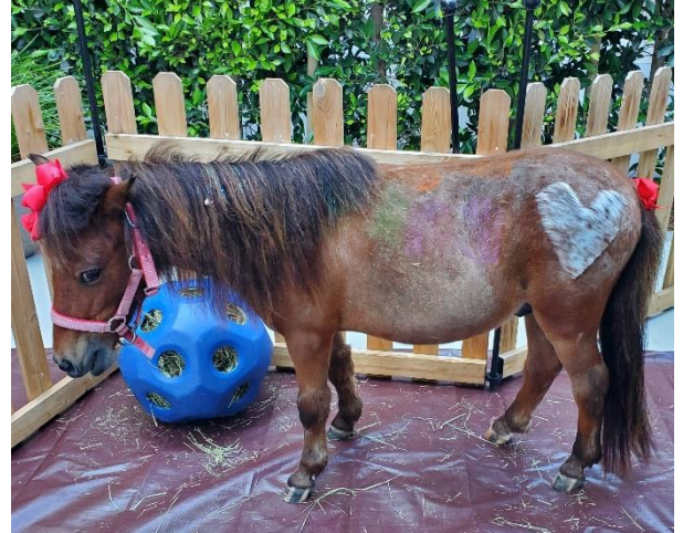
(Amazing Mini Miracles, Mini Horses)

Each year we work to expand the opportunities for self-care and wellness on-site at the Summit. This year we again provided multiple self-care sessions which incorporated yoga, journaling, reiki, art therapy and collage, and variations of meditation and mindfulness. We also had a dedicated self-care room where attendees could disconnect from the content of the Summit and engage in personal self-care activities throughout the week. Clinical staff were available for any attendee needing support.