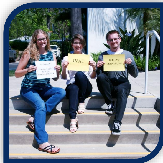
Staff show support for survivors of sexual violence by wearing denim on Denim Day, April 24, 2019

Our Vision is a world free from violence, abuse and trauma. IVAT condemns violence and oppression in all its forms. We stand with all who work for equality and peace. No one deserves to endure violence, abuse or trauma in their lifetime.