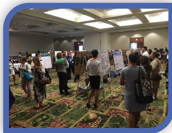
Poster Presentation at the 16 th Hawai`i International Summit