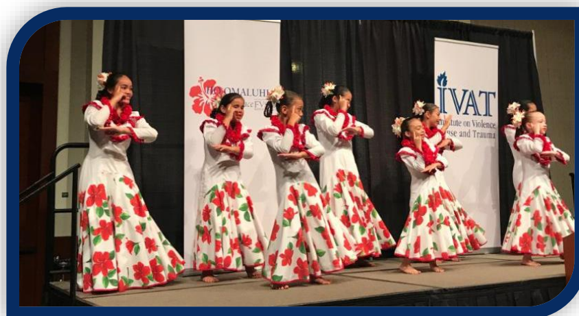
Halau Hula Olana - Na Keiki at the 16 th Hawai`i International Summit